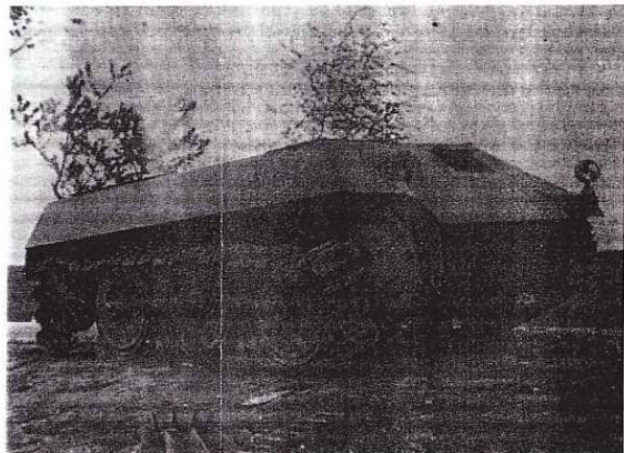
Photo No. 2. Right front view. Note construction of sprocket (outer part on ground) and assistant driver's vision slit in side plate.